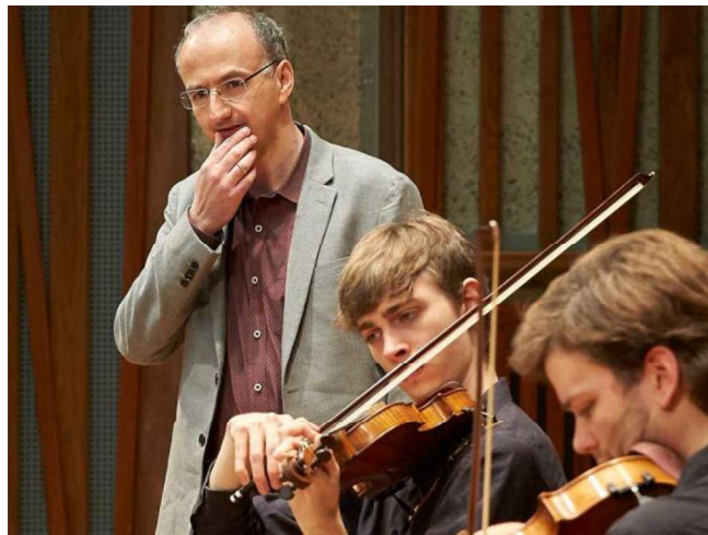
Takács Quartet masterclass