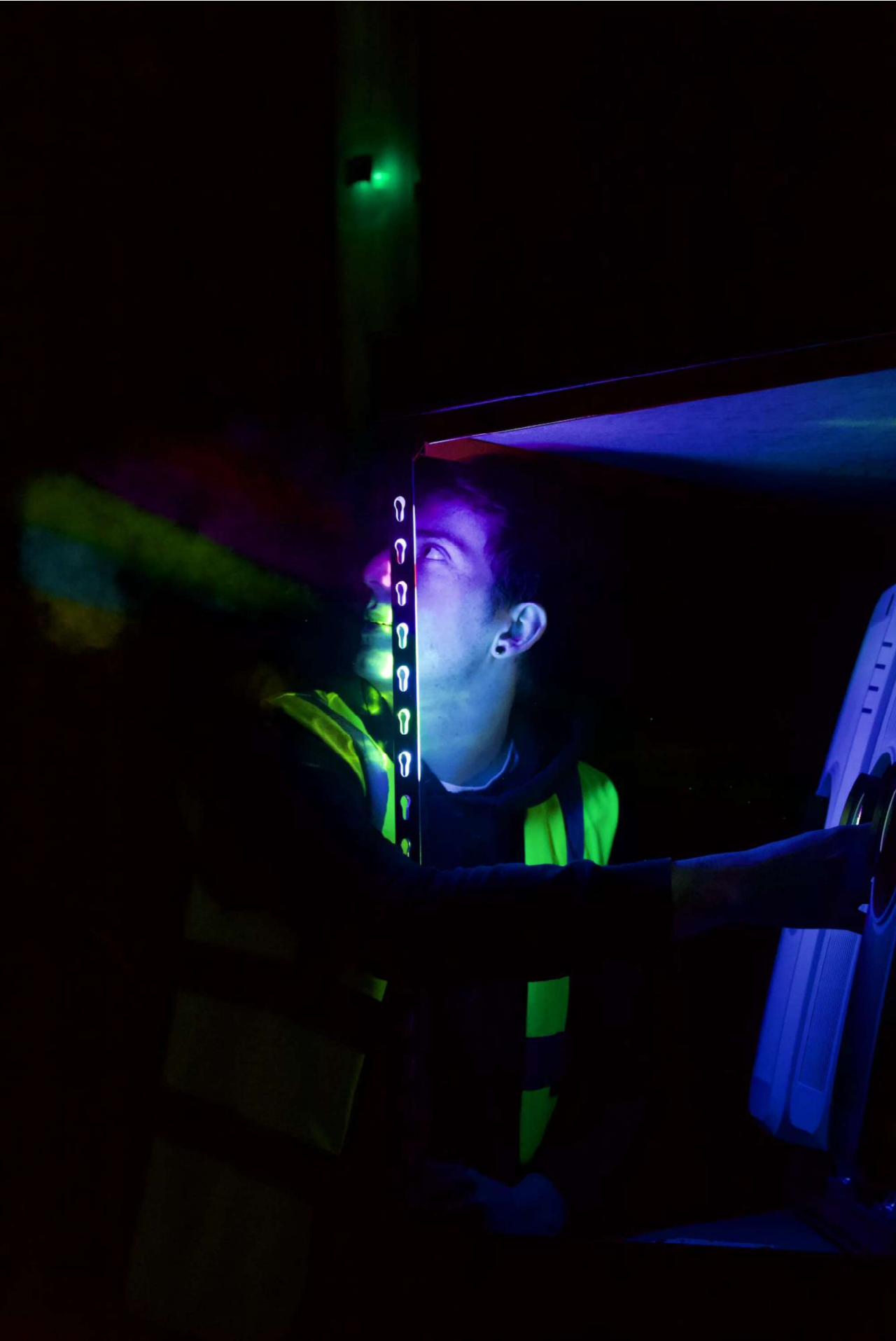
Tower Bridge: 125 Years of London's Defining Landmark, Nov 2019