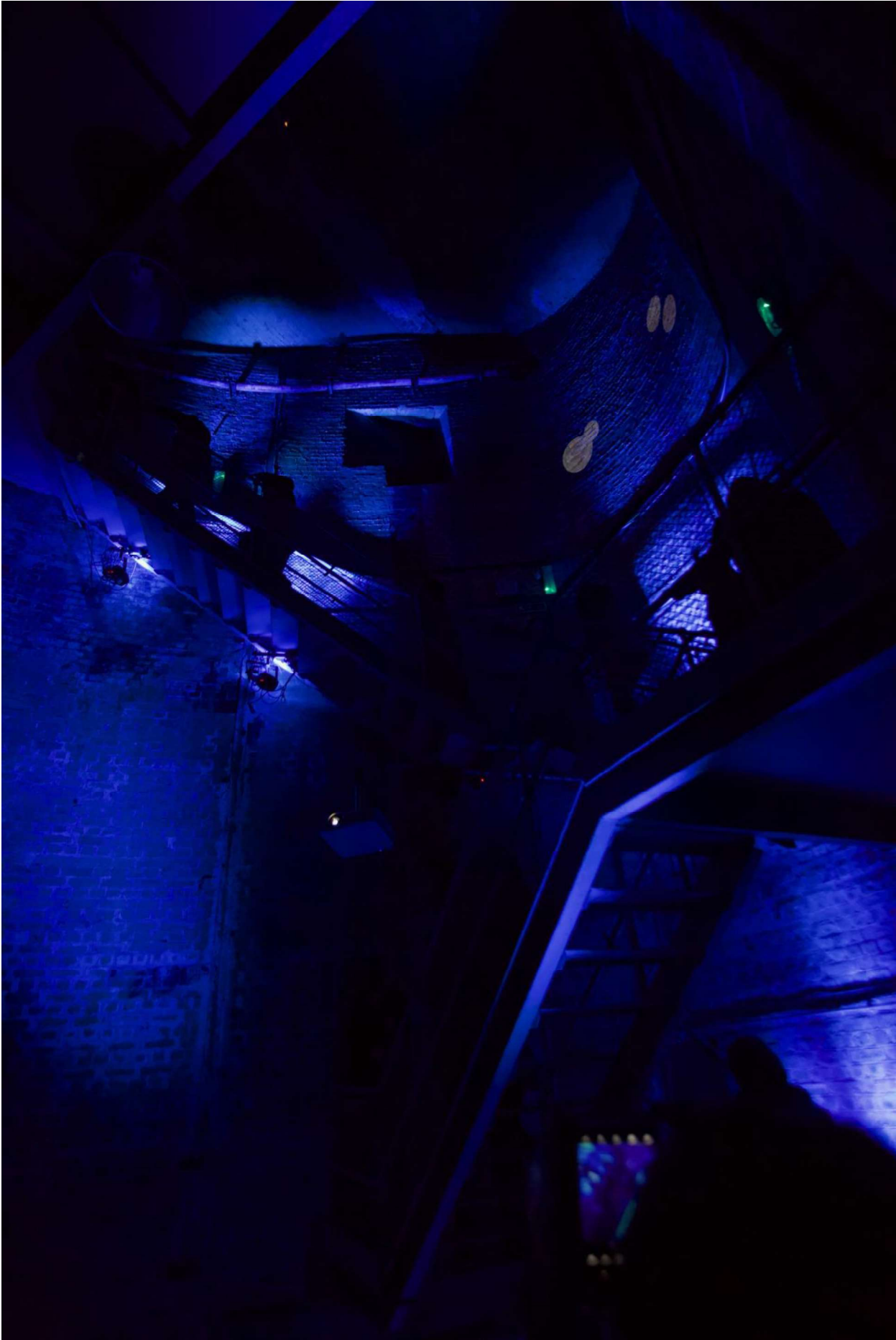
Tower Bridge: 125 Years of London's Defining Landmark, Nov 2019