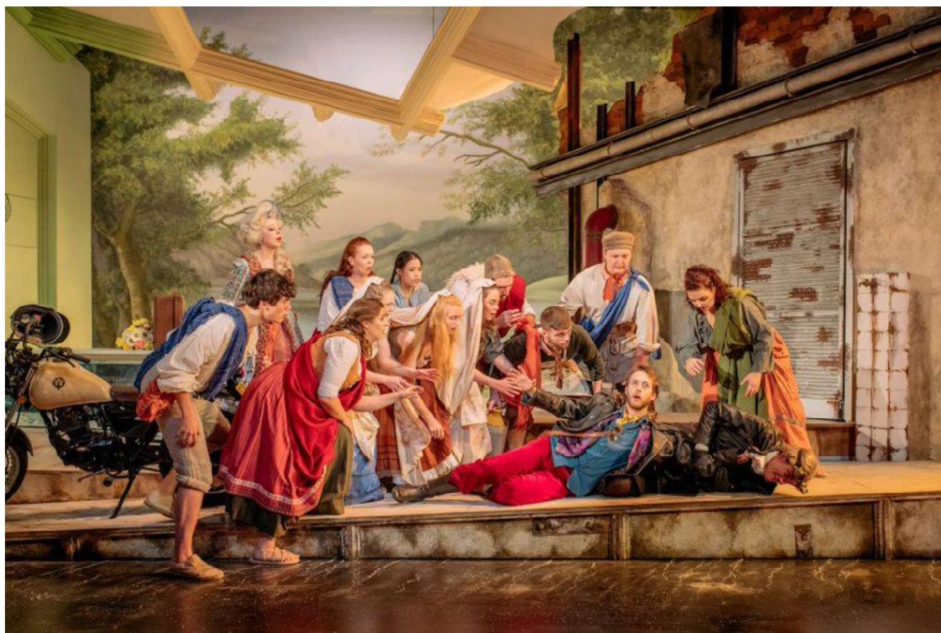
La Fedelta Premiata , Nov 2019