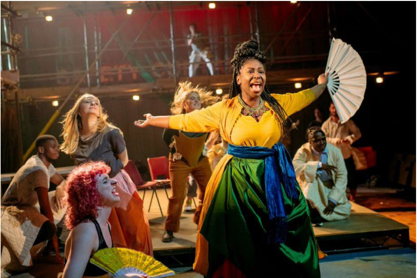
Provok'd: A Restoration, Nov 2019

The Trust is immensely grateful to all its donors, including individuals, liveries, companies and trusts whose support has made such a difference to the lives of students, staff and to the delivery of educational programmes at the School. This year donations have helped students to stay in training and support themselves during the COVID-19 pandemic, alongside empowering them to realise their full potential, enriching the lives of others and leading cultural change.