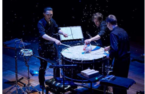
Guildhall percussionists

Income raised through the Trust has enabled a variety of artistic projects, directly supporting Guildhall School's students: