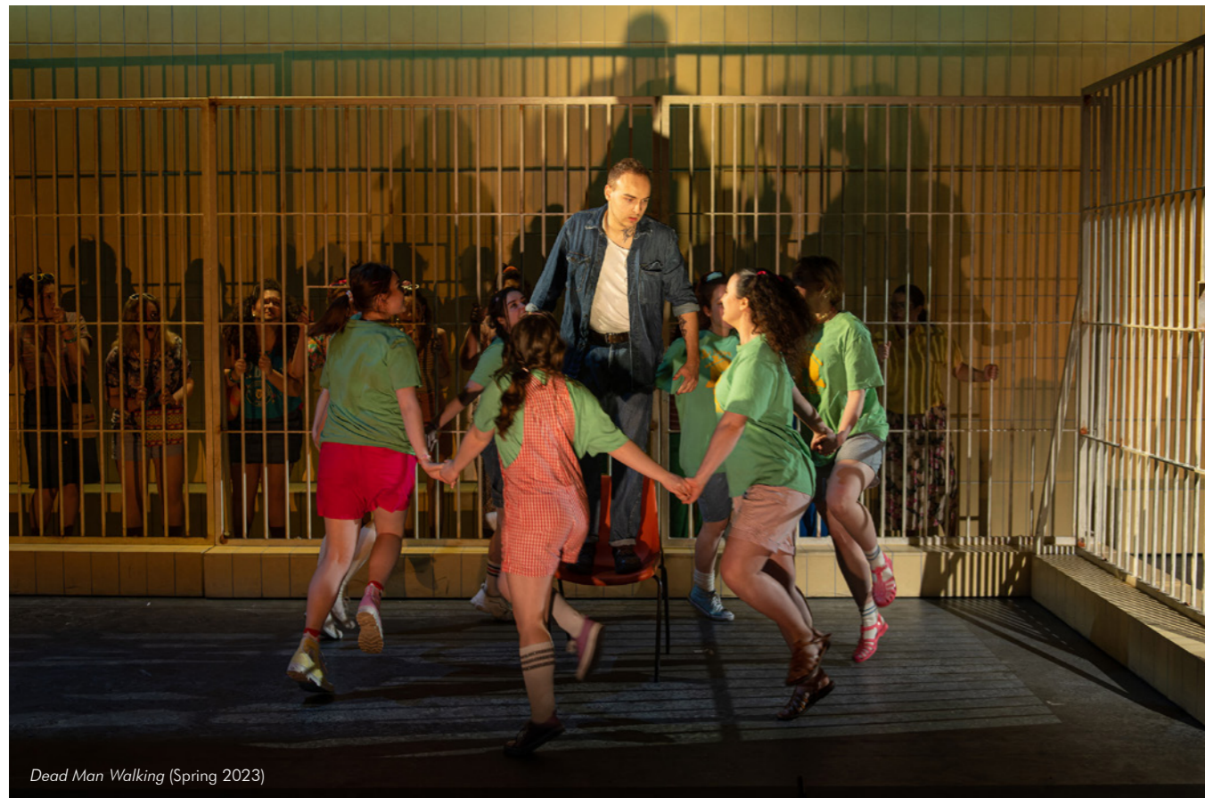
Dead Man Walking (Spring 2023)