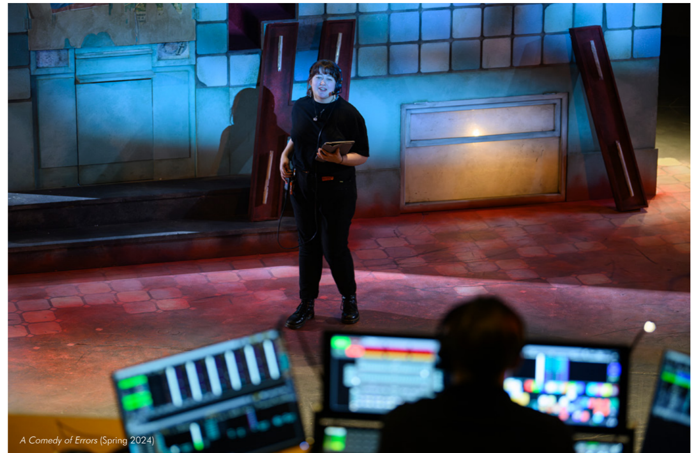
A Comedy of Errors (Spring 2024)