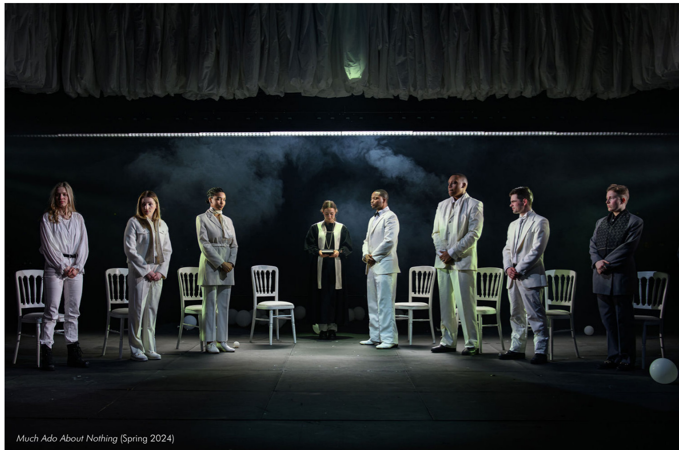
Much Ado About Nothing (Spring 2024)