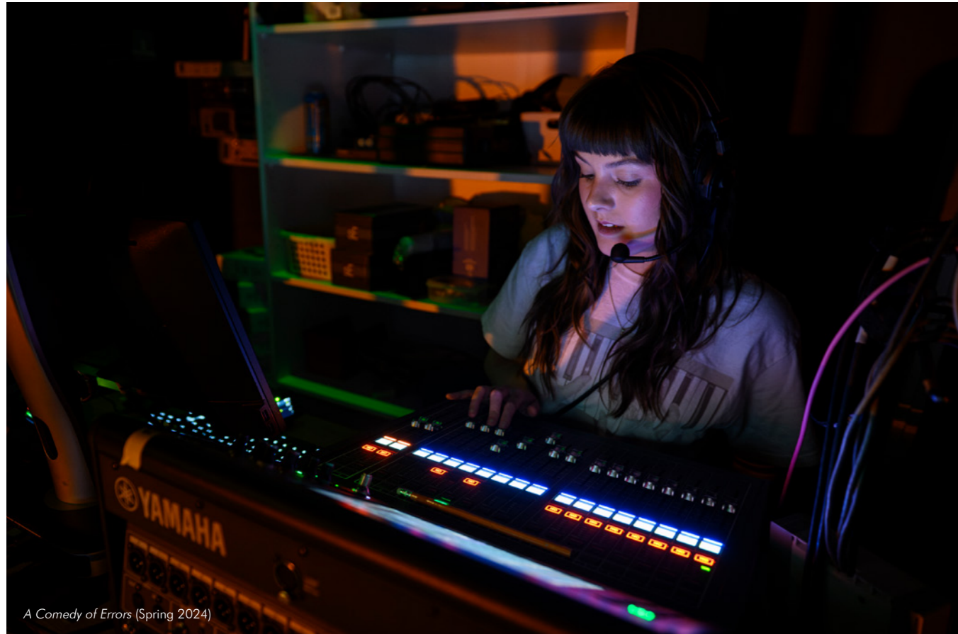
A Comedy of Errors (Spring 2024)