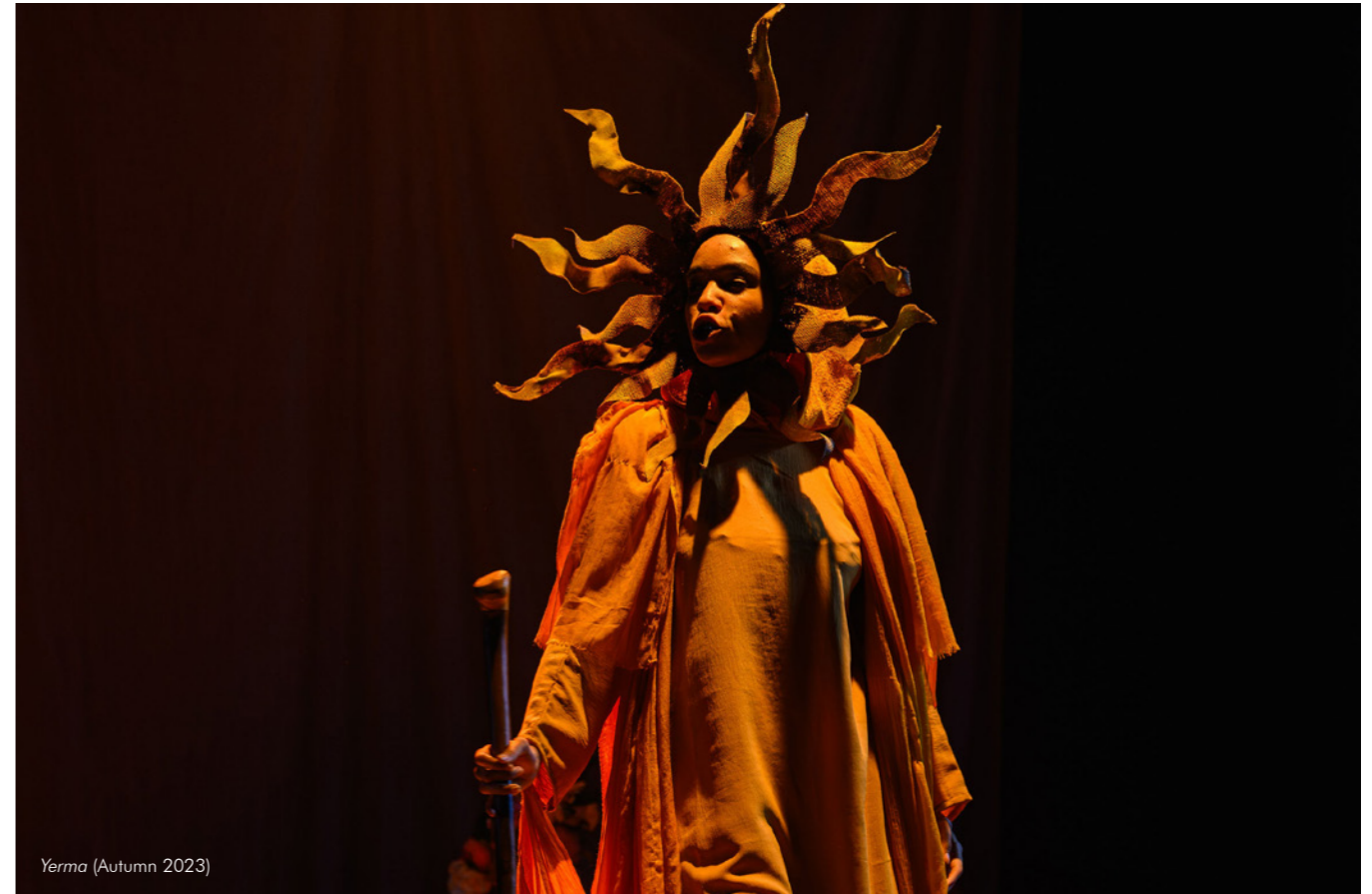
Yerma (Autumn 2023)