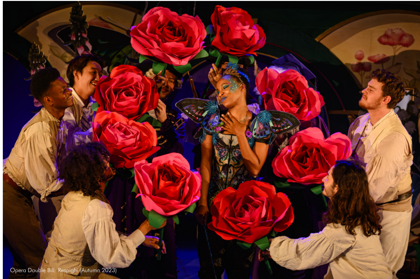
Opera Double Bill: Respighi (Autumn 2023)