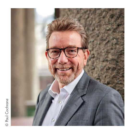
This academic year has brought with it yet another exciting 12 months at Guildhall School.

We kicked off the year by celebrating the 10th anniversary of our world-class performance venue and teaching facility, Milton Court. The building has contributed to the cultural life of the School, the Barbican and the City of London, and it has been a real joy to mark such a special decade. In January, we travelled further afield to hear three Guildhall postgraduate students perform in the latest in the School's now biennial series of recitals at New York's world-renowned Carnegie Hall. This wonderful evening was quickly followed by the fantastic news that Guildhall School will become the first UK partner of Carnegie Hall's Link Up music education programme, which introduces primary school age children to the orchestra by immersing them within it.